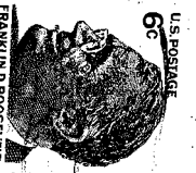
FRANKLIN D. ROOSEVELT